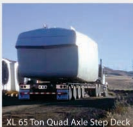
XL 65 Ton Quad Axle Step Deck