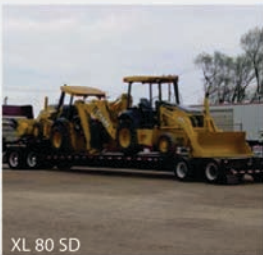
XL 80 SD