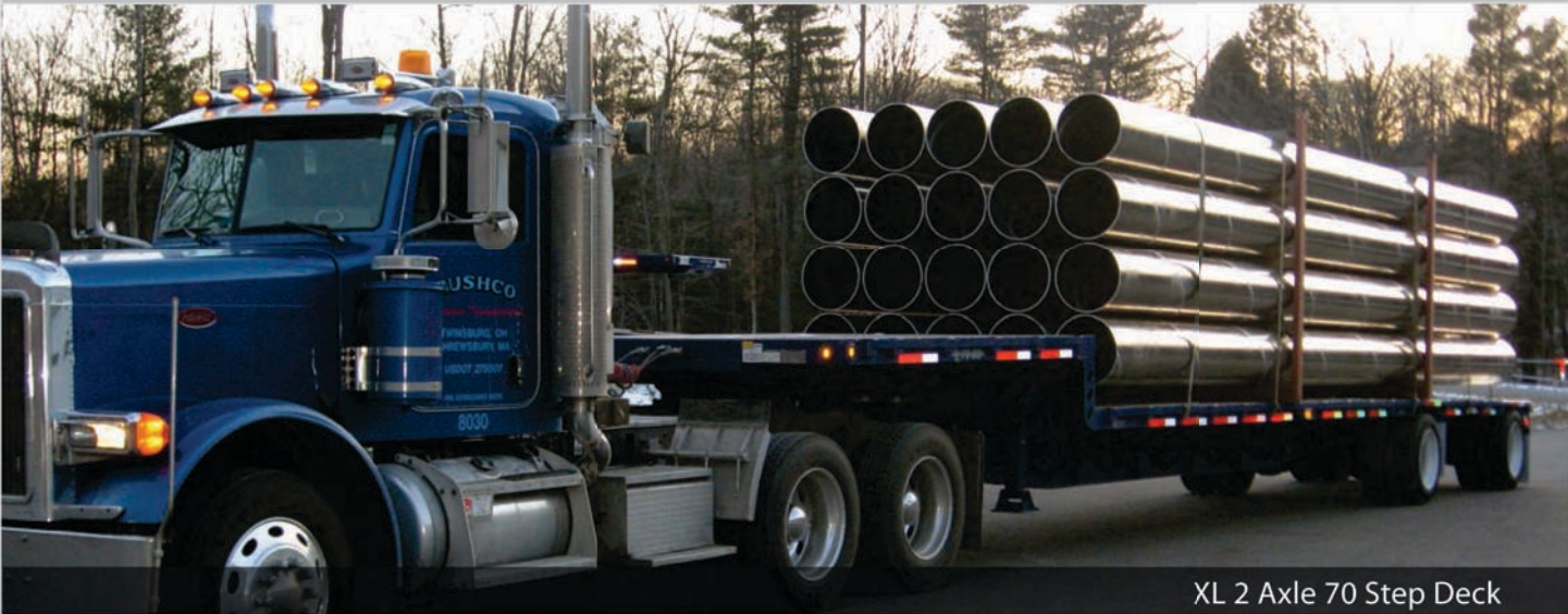
XL 2 Axle 70 Step Deck