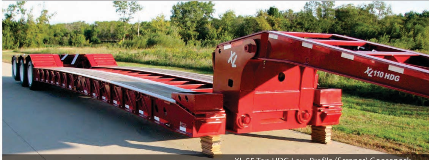
XL 55 Ton HDG Low-Profile (Scraper) Gooseneck