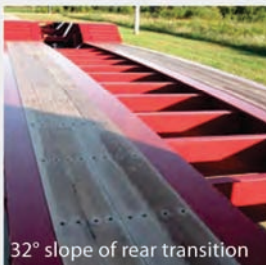
32° slope of rear transition