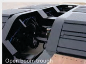
Open boom trough