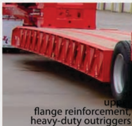
up flange reinforcement, heavy-duty outriggers

The low-profile deck, with a 26' well and a 32° slope of rear transition area makes loading vehicles onto the rear deck extremely efficient for hauling Scrapers and trucks of all sizes.