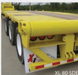
XL 80 SDE

XL products are designed to fit your needs. The 39½" loaded deck height makes hauling taller equipment while avoiding extra permit costs easy. The XL Step Deck also comes in 36" and 30" loaded deck height versions.