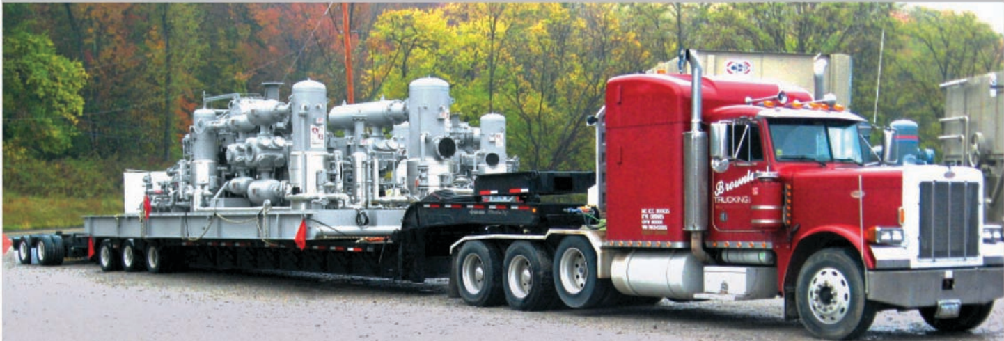
XL 120 Step Deck Extendable