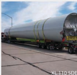
XL T10 SDE

The XL Extend-A-Trac allows for extending and retracting the trailer without hooking and unhooking air and electrical lines. 6" greasable rollers incorporate an oil impregnated bronze bushings to make extending easy.