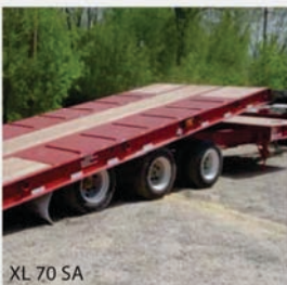
XL 70 SA