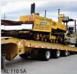
XL 110 SA

The XL Slider, a lowboy trailer, features an extended dump angle of 17 degrees , and improved hydraulics to keep your equipment from unnecessary wear. Hydraulic sliding axle assembly with traveling bumper provides under ride protection.