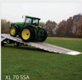
XL 70 SSA

A 6½ degree load angle permits you to easily load pavers and rollers, while the winch at the front loads inoperable equipment. A single 2 stage cylinder provides maximum travel and minimal maintenance .