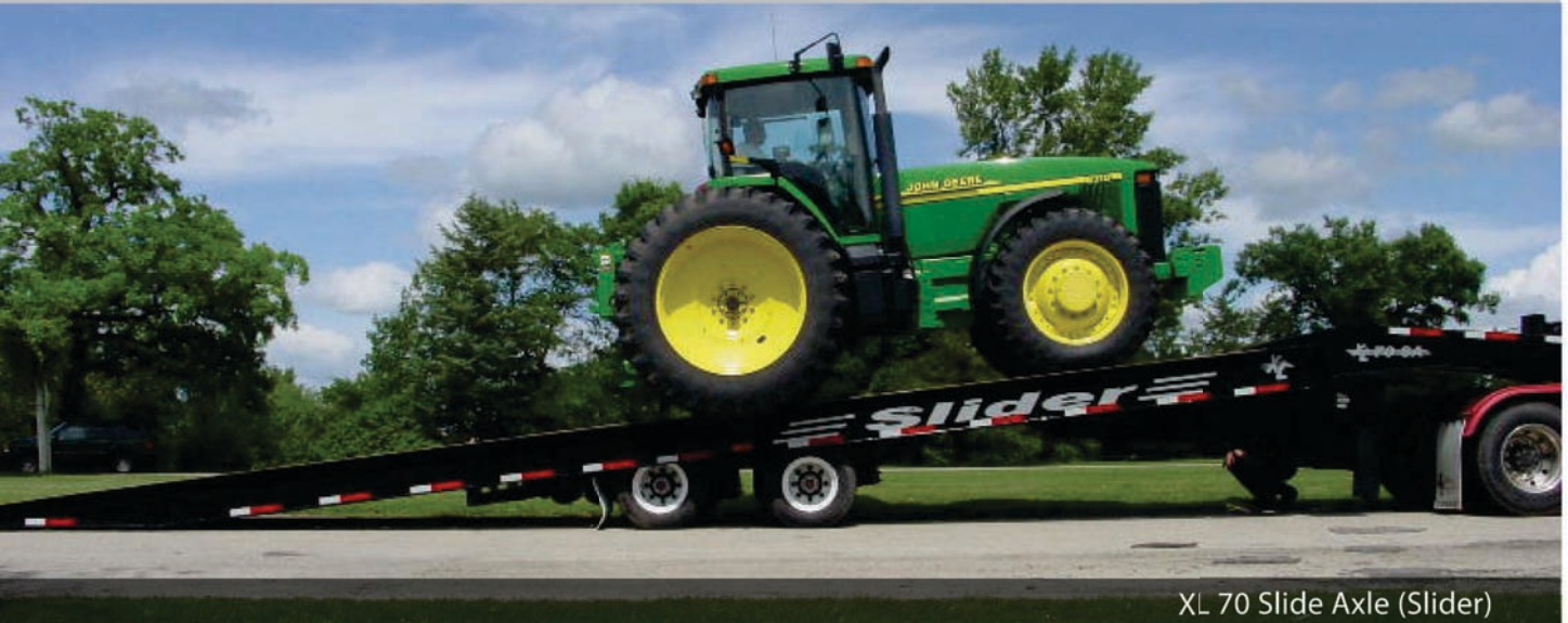
XL 70 Slide Axle (Slider)