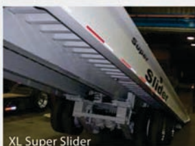
XL Super Slider