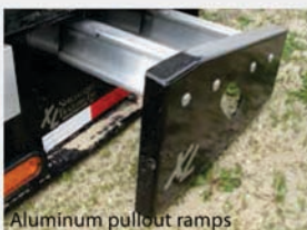
Aluminum pullout ramps