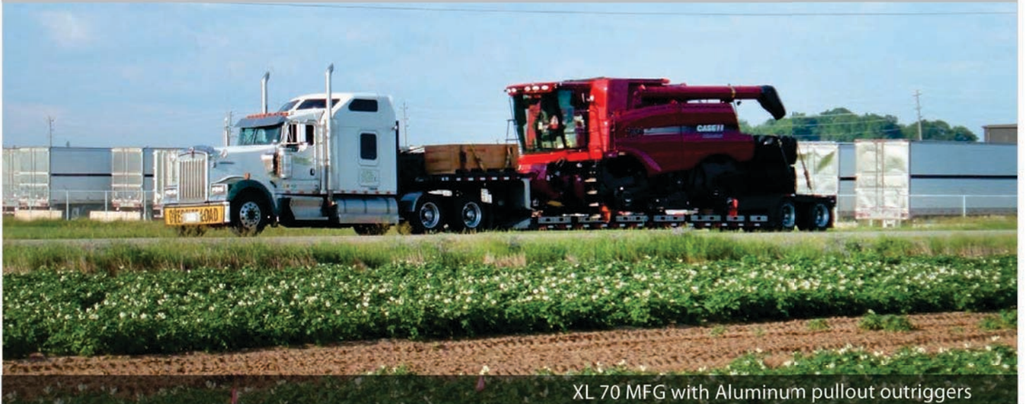
XL 70 MFG with Aluminum pullout outriggers