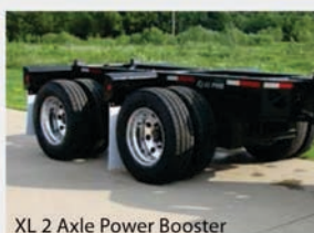
XL 2 Axle Power Booster