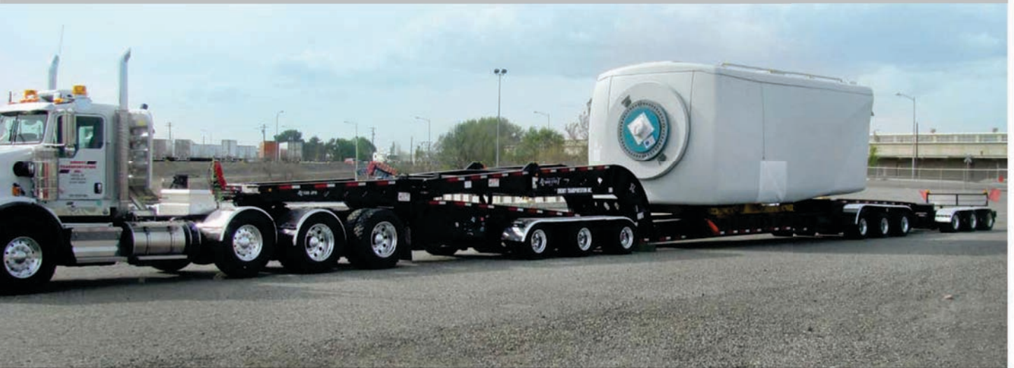
XL Lightweight 13 Axle West Coast