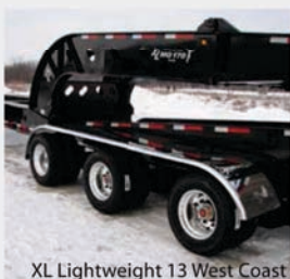
XL Lightweight 13 West Coast

The XL Lightweight 13 Axle combines an XL 3 Axle Jeep, 170 Mechanical Gooseneck and an XL 3 Axle Booster to create a revolutionary, custom-engineered multi-axle set-up .