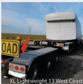
XL Lightweight 13 West Coast