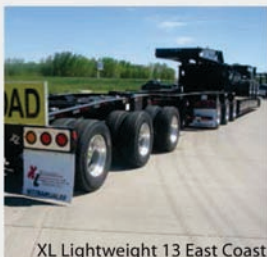
XL Lightweight 13 East Coast

The XL Lightweight 13 Axle weighs roughly 10,000 lb less than the market norm . 10,000 lb in weight savings results in 10,000 lb more payload. It hauls loads that would normally require 19 axles, on 13 axles.