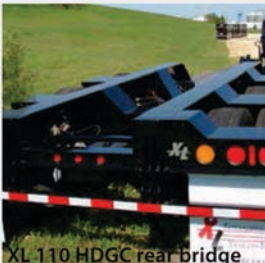
XL 110 HDGC rear bridge

The deep well was specifically designed for long booms, to eliminate the need to detach the lower boom section. The deep bucket well through rear sill easily accommodates excavators. The lowered rear angle from deck to wheel area allows for easier loading of equipment over rear deck.