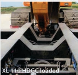
XL 110 HDGC loaded

XL hydraulic necks are wider and stronger than the industry standard. 1 \frac{3}{4} " Apitong decking allows for \frac{3}{4} " raised decking to keep tracks from slipping. Features such as heavy-duty removable outriggers and lowered heavy-duty bolsters combine for truly durable results.