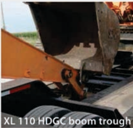
XL 110 HDGC boom trough