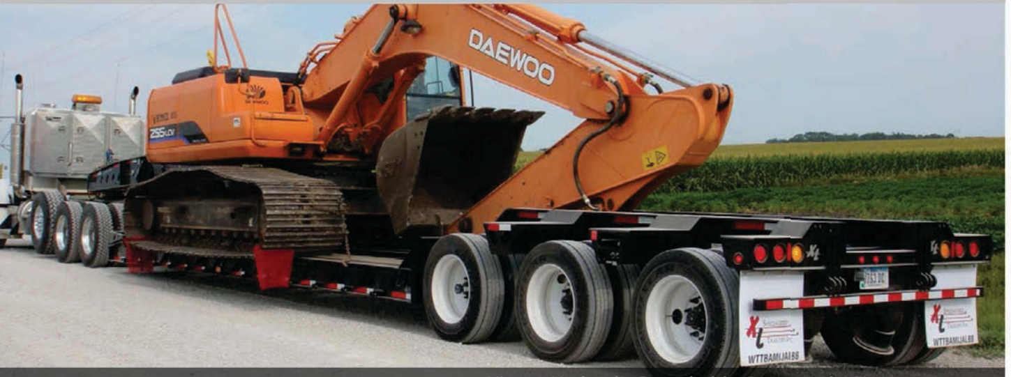
XL 110 Hydraulic Detachable Gooseneck: Construction