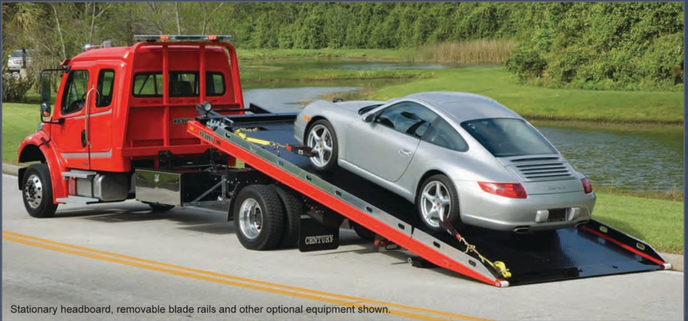
Stationary headboard, removable blade rails and other optional equipment shown.

At Century, we feel that "Keeping up with the Industry" is nothing but an excuse. If we can't produce a product that is superior to everything in its class... then you won't see our name on it. Our Car Carriers are a perfect case-in-point. They possess every standard feature that you would expect from a World Leader, brought together in a sleek, attractive and durable package. With an independent wheel lift system, positive lock down, extra-low loading angle, and easy one-man operation, Century Carriers have driven past every limitation that has held "The Industry" in check. Century leaves no room for argument.